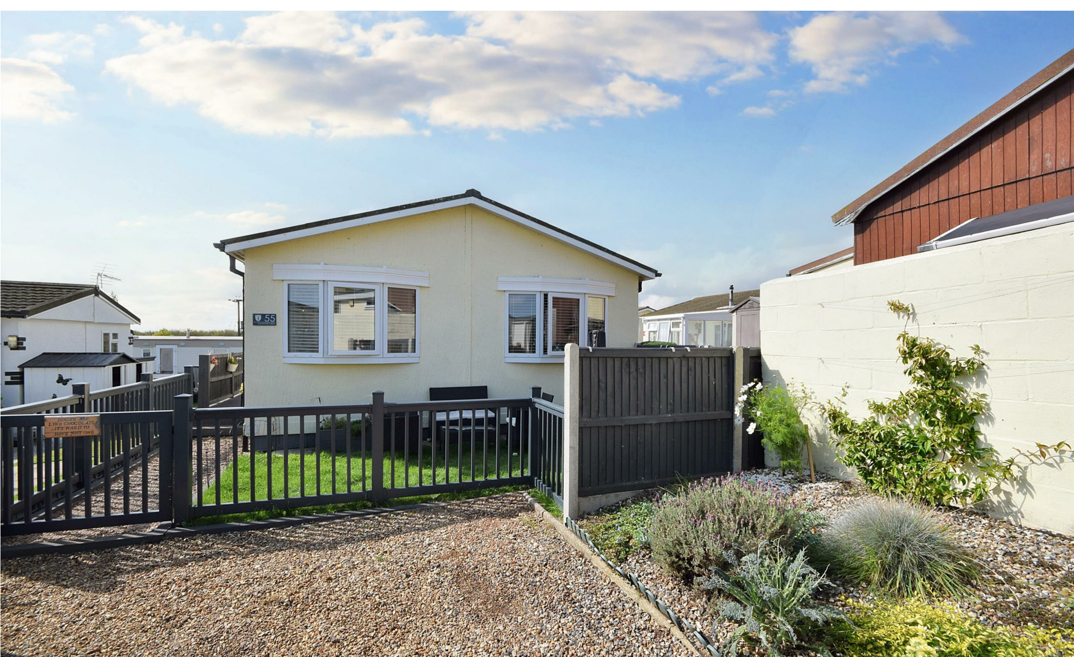
Trimmingham House | Trimmingham | NR11 Guide Price £70,000